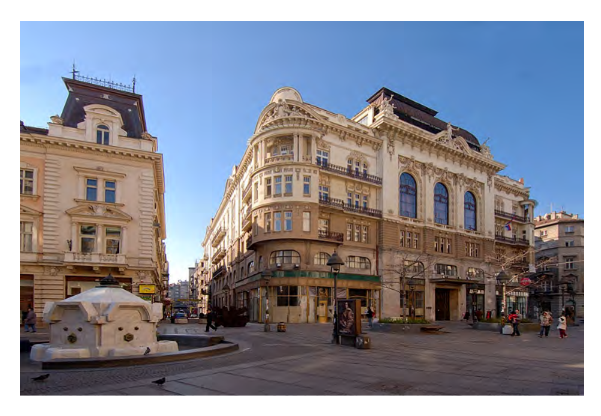
Serbian Academy of Sciences and Arts (SASA).